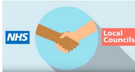
What is an STP? (2mins 14s)