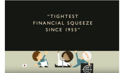
Financial Challenge (1min 50s)