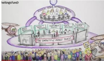
NHS Structure (6mins 30s)

Please watch these videos to get an idea of what's going on in the NHS today (links to external site).