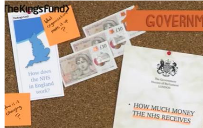
How does the NHS work? (6mins 33s)